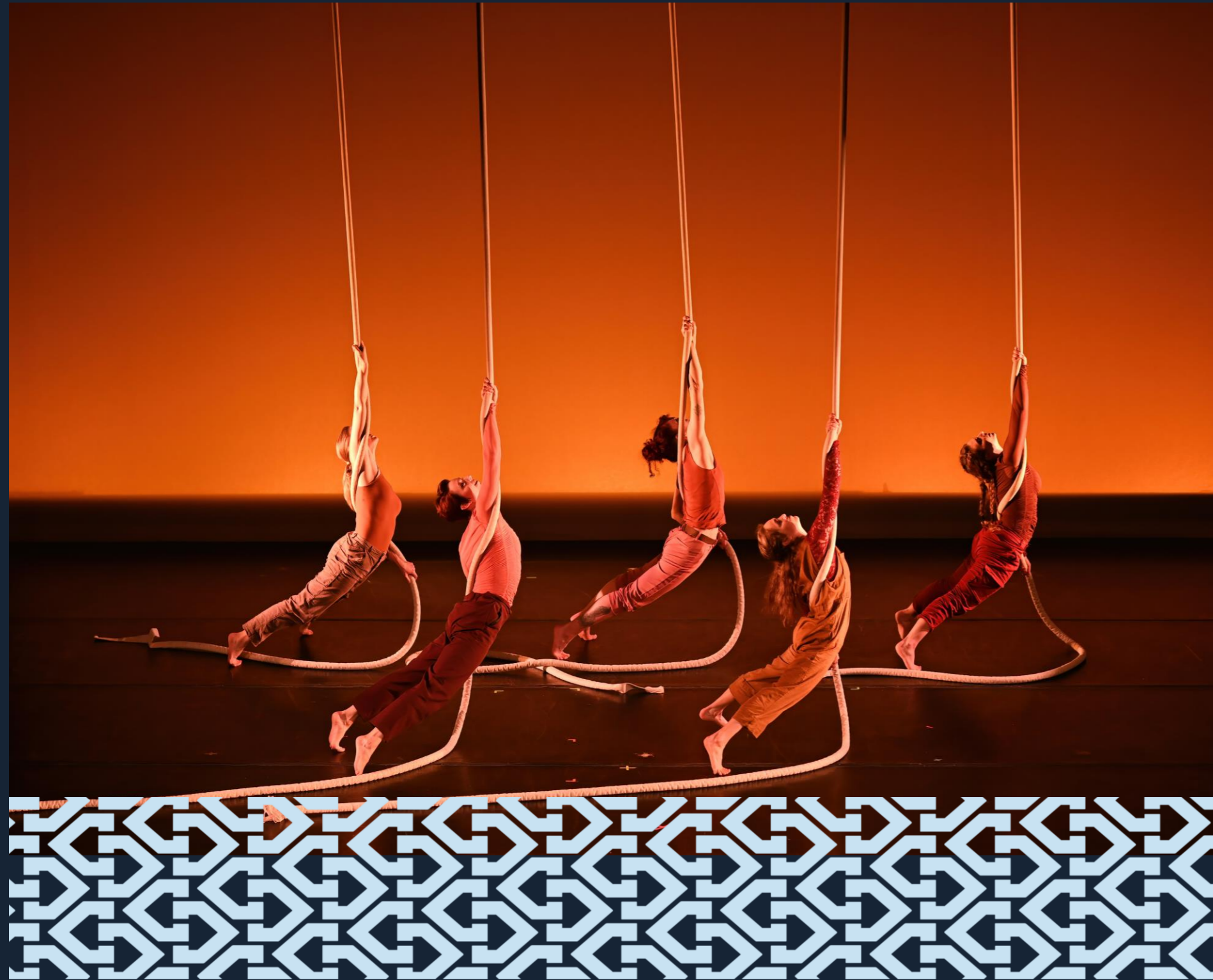
"Gathering the Threads" : Circus 617