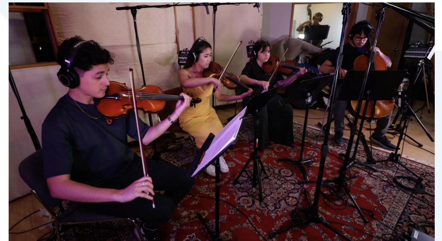
"The Ancestral Call"

NOTE: Projects can include a visual art or film component