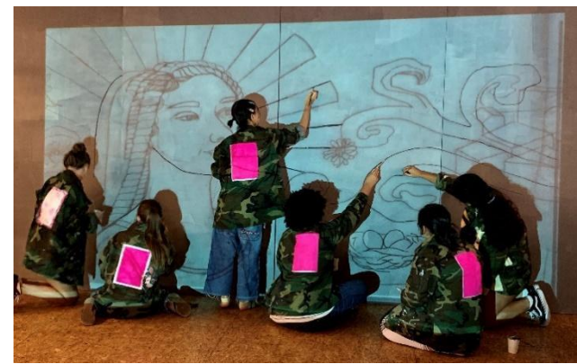
Mural sketch by Raw Art Works teens in Lynn

The 10 grantees, chosen for their proven work with youth arts in Greater Boston, include: