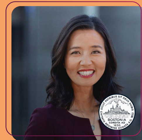
MICHELLE WU Mayor, City of Boston