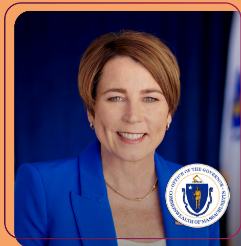
MAURA HEALEY Governor, Commonwealth of Massachusetts