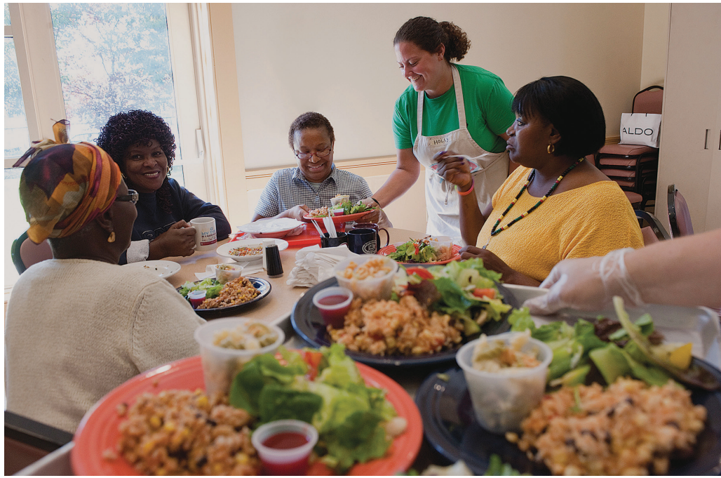
Lunch at Rosie's Place