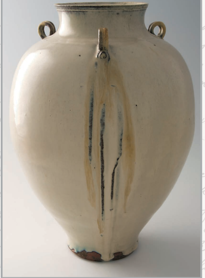
A SPECIAL ARTS INITIATIVE OF THE BOSTON FOUNDATION

...ck ...val ...arte ...nergy ...y con ...dev ...hode ...They ...ion, ...muse ...ems ...of as ...but jo ...to do ...yself ...ehav ...it w ...won ...nd. ...ists have always oscillated bet ...edge" and the thread of traditio ...cutting themselves off entirely ...ose roots. Tradition after all ...g of the spirit, not a recycling ...k. However "contemporary" it's there.